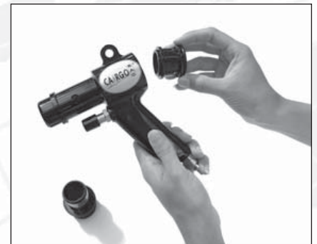
3. Pull the black insert and the O-rings out of the air tool.