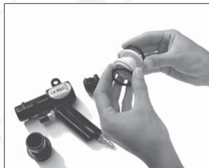
5. Place the two O-rings on the yellow insert.