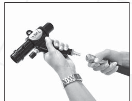
9. Connect the air tool to the air tube again.