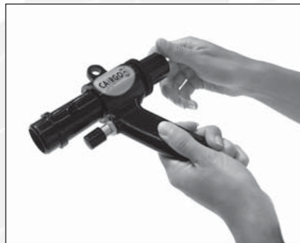
2. Screw off the back of the air tool.