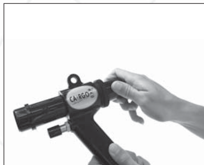
8. Screw the back of the air tool on the air tool.