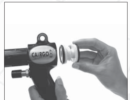
6. Put the yellow insert into the air tool.