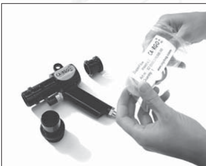
4. Take the supplied yellow insert out of the packaging.