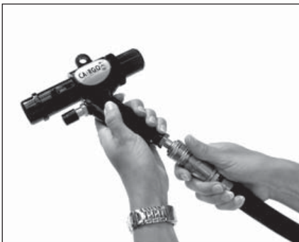
1. Disconnect the air tool from the air tube.